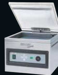
vacuum packaging machine from Komet – Vacuboy allround machines